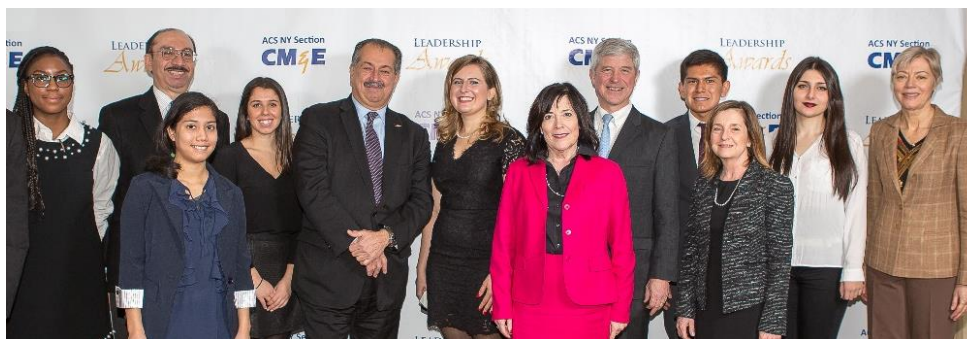
2014 ACS scholars, mentors and sponsors (above). 2015 Alan Alda and the CME Board (below).