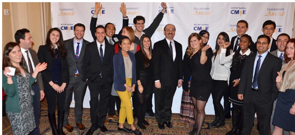
Since 2011 CME has helped over 300 STEM students develop networking and leadership skills.

Provided forum for first speaking engagements of chemistry industry CEOs in NYC