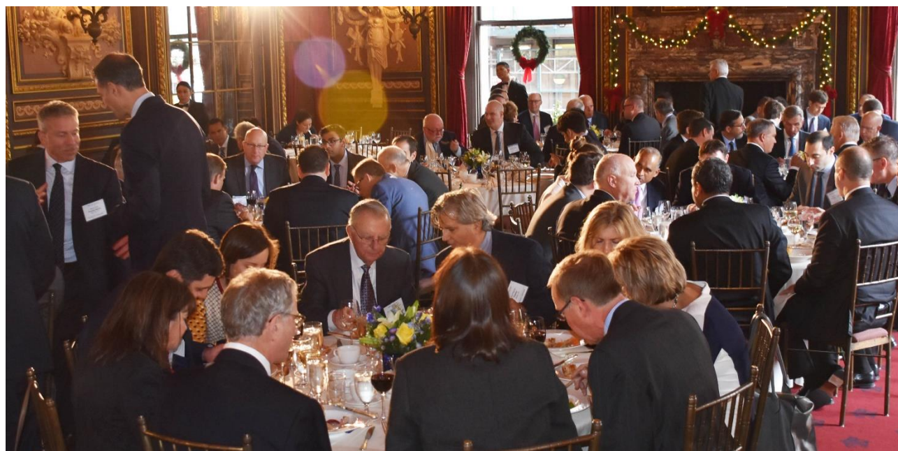
Above: Trinseo Table. Below: CME Table.