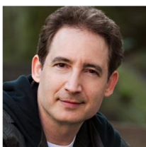
Brian Greene World Science Festival Chairman