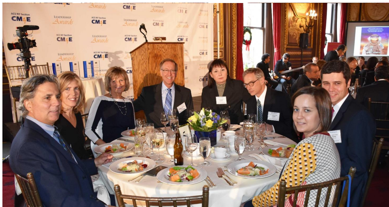
Above: Pappas Family Table. Below: Trinseo Table.