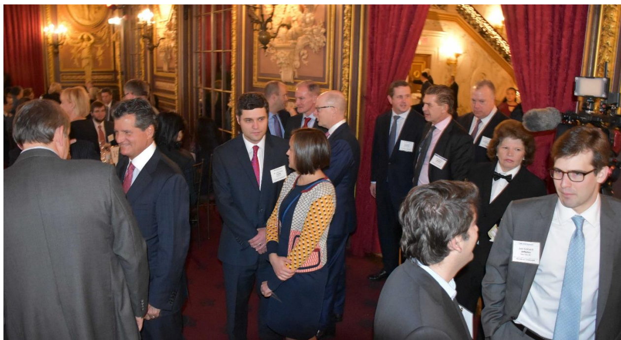
Above: Guests go to luncheon tables. Below: CME ACS registration team at the Great Hall.