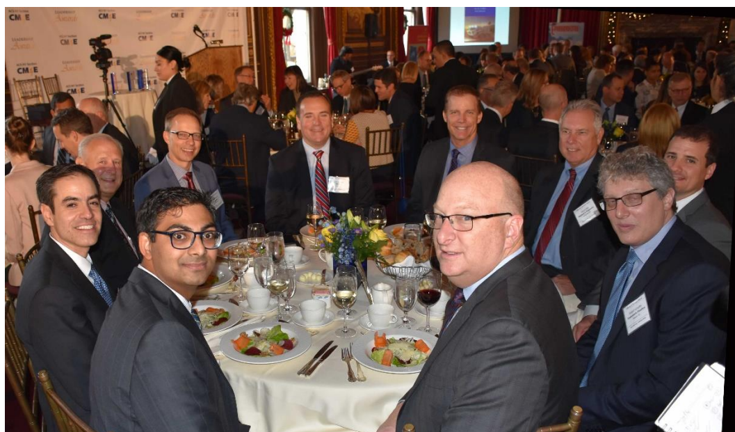
Above: AmSty Table. Below: PwC Table.