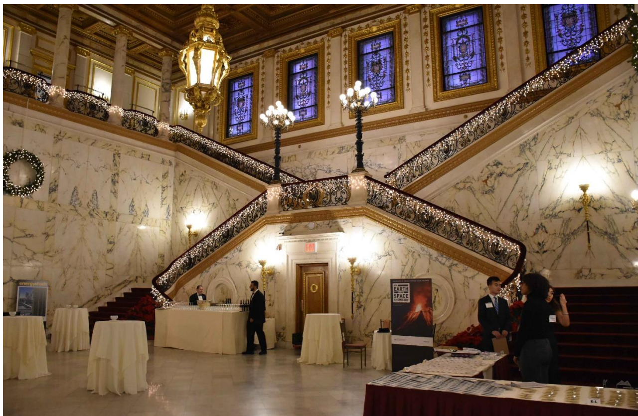
Top: Metropolitan Club Great Hall. Bottom: West Lounge (website picture).