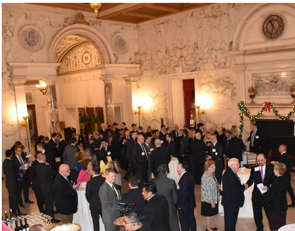
Leadership Awards event reception at the Metropolitan Club Great Hall.