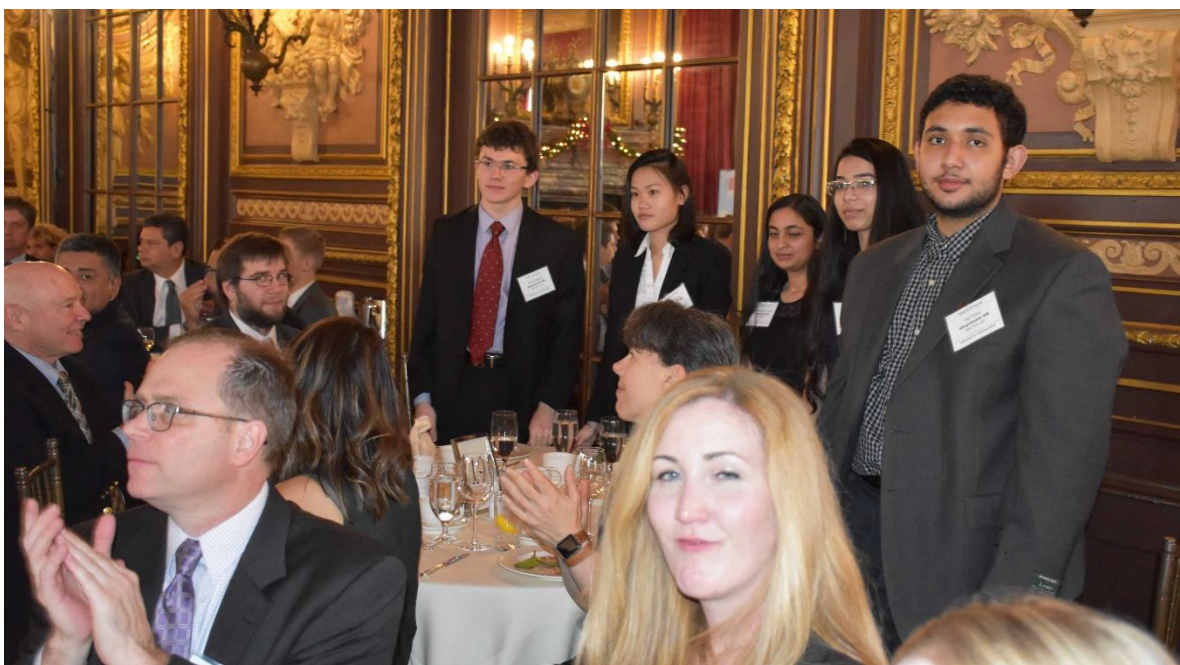
Above: Students from Stuyvesant High School. Below: Award Presentation Remarks