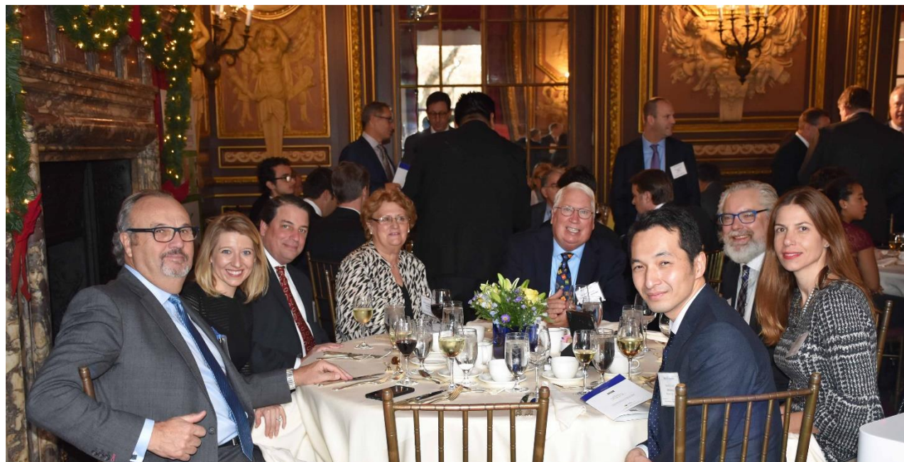
Above: Shionogi Table. Below: ACS Publications Table.