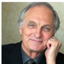
Alan Alda SUNY Stony Brook Alan Alda Center for Communicating Science