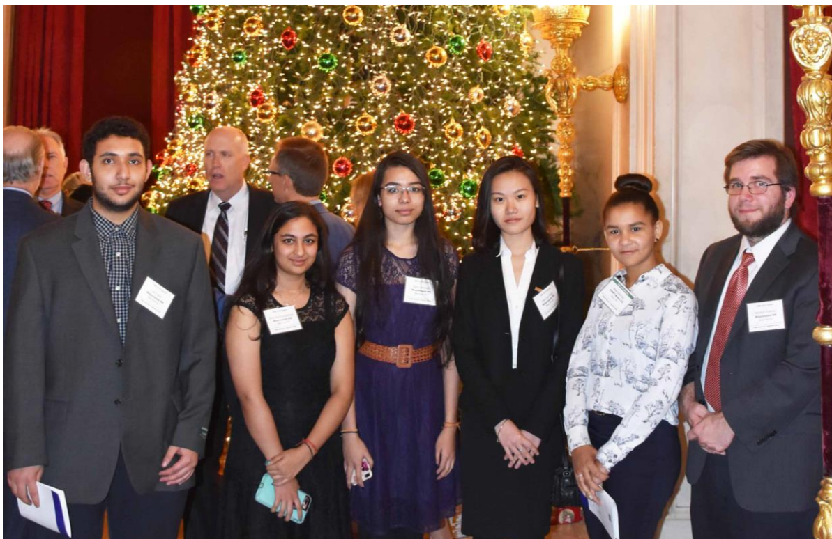
Above: STEM students and teacher from Stuyvesant High School. Below: CME table.