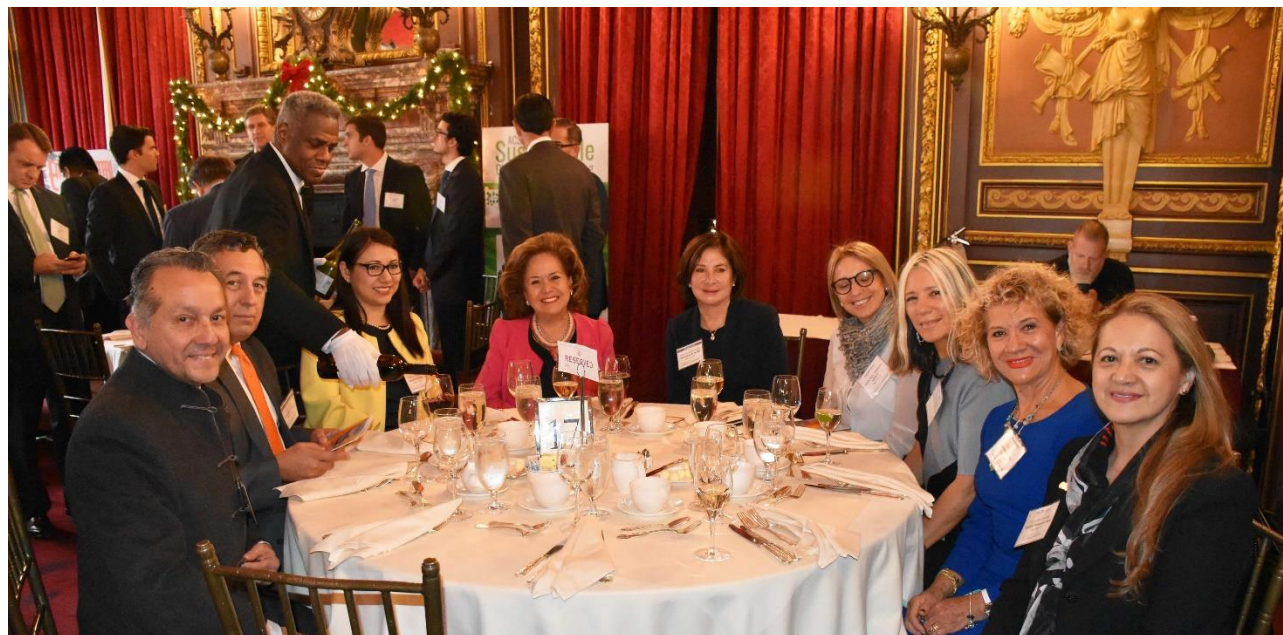
Above: Peruvian delegation from the consulates of NY and NJ and the United Nations. Below: Table with Peruvian Executives from Wall Street.