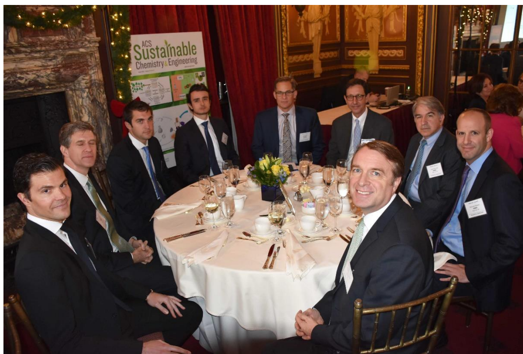
Above: HSBC Table. Below: Bain, Arsenal, Dow Tables.