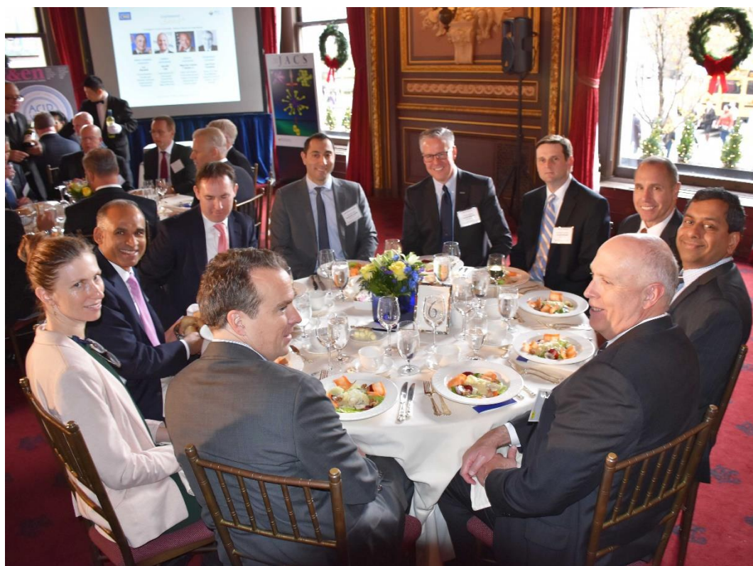
Above: LyondellBasell Table. Below: Univar Table.