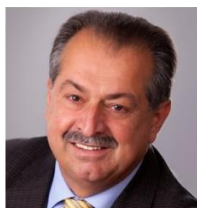
Andrew N. Liveris Chairman and CEO Dow Chemical